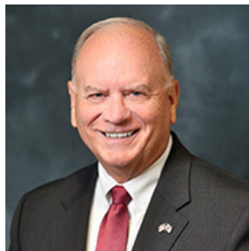
Senator Ed Hooper