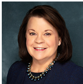
Senator Colleen Burton